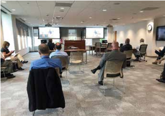
ACI chapter members supporting code change proposals in North Carolina

As ACI continues to promote and seek opportunities for advocating for the adoption of its building codes, standards, and certifications on the state and local levels, participation by its members on the local level will continue to grow. If you are interested in participating in the code development process on the state or local level, contact one of the ACI Code Advocacy Engineers: Kerry Sutton at kerry.sutton@concrete.org or Steve Szoke at steve.szoke@concrete.org . The success of these efforts relies primarily on the grassroots engagement of ACI members.