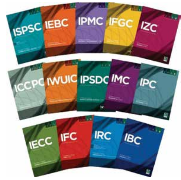
Fig. 1: ICC-developed model codes (refer to www.iccsafe.org)

In 2017, the ACI Board of Direction modified the ACI mission: "ACI develops, disseminates, and advances the adoption of its consensus-based knowledge on concrete and its uses." The additional phrase (shown in bold text) was included to recognize that the general public is the ultimate beneficiary of most ACI committee work on standards and certification programs; and it encourages ACI members, as part of a professional society, to advocate for the use of those standards and programs for the benefit of society. Ideally, this is accomplished by having ACI standards and programs properly referenced in the building code. Because most building codes are based on model building codes, the most efficient method is to incorporate ACI standards and programs in the model codes developed by ICC.