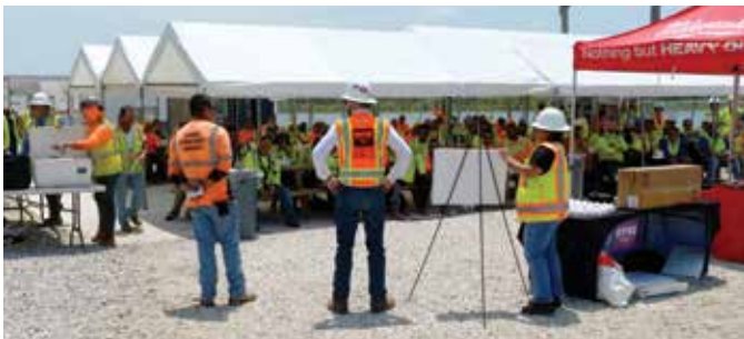
GPRS safety experts presenting at a jobsite

From January 29 to February 2, 2024, Ground Penetrating Radar Systems (GPRS) hosted the Concrete Sawing & Drilling Safety Week (CSDSW). Cutting and coring have the potential to create significant risks, such as fall hazards, electrical shock, injuries and lacerations, and silica and dust exposure. With that in mind, GPRS stands as the primary sponsor of CSDSW to increase awareness of concrete safety throughout the construction industry. As a part of the program, throughout the week, GPRS offered the opportunity to have its safety experts come out to jobsites and offices to provide presentations to help companies enhance their safety and ensure that teams are educated on best practices. Topics of discussion included the different types of saw cutting and core drilling that could be present on a site; best practices when choosing the right company to scan, cut, and core concrete; best practices for personal protective equipment and company-provided safety measures; how individuals can mitigate risk when cutting or coring concrete; common risks associated with concrete sawing and drilling; and Occupational Safety and Health Administration (OSHA) standards and best practices for working safely with silica. Moving forward, GPRS encourages companies to take steps to work toward a safer workplace beyond CSDSW by reaching out to their local GPRS safety expert.