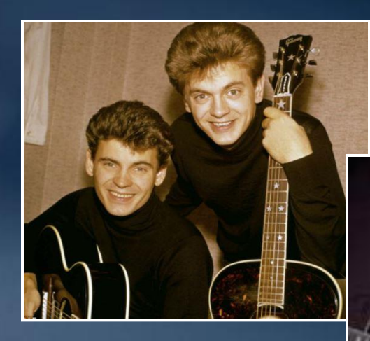
The Everly Brothers