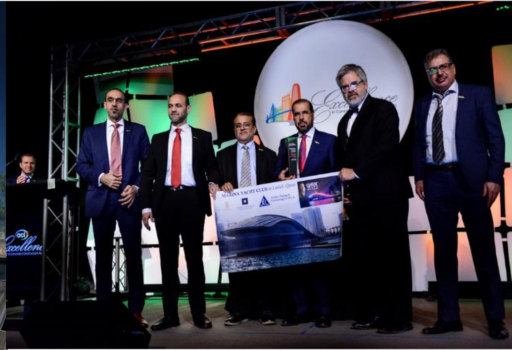
Awardees during the Gala night

https://www.youtube.com/watch?v=G3vyY3VgP84