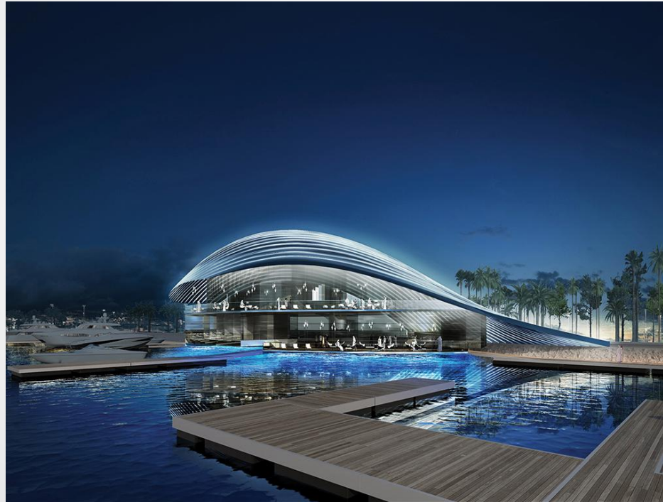
The Winning project : Lusail Marina Yacht Club Project