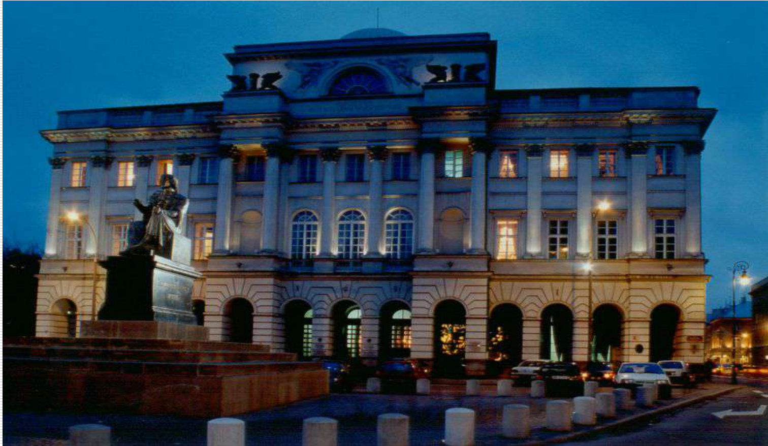
Headquarters of the Polish Academy of Sciences