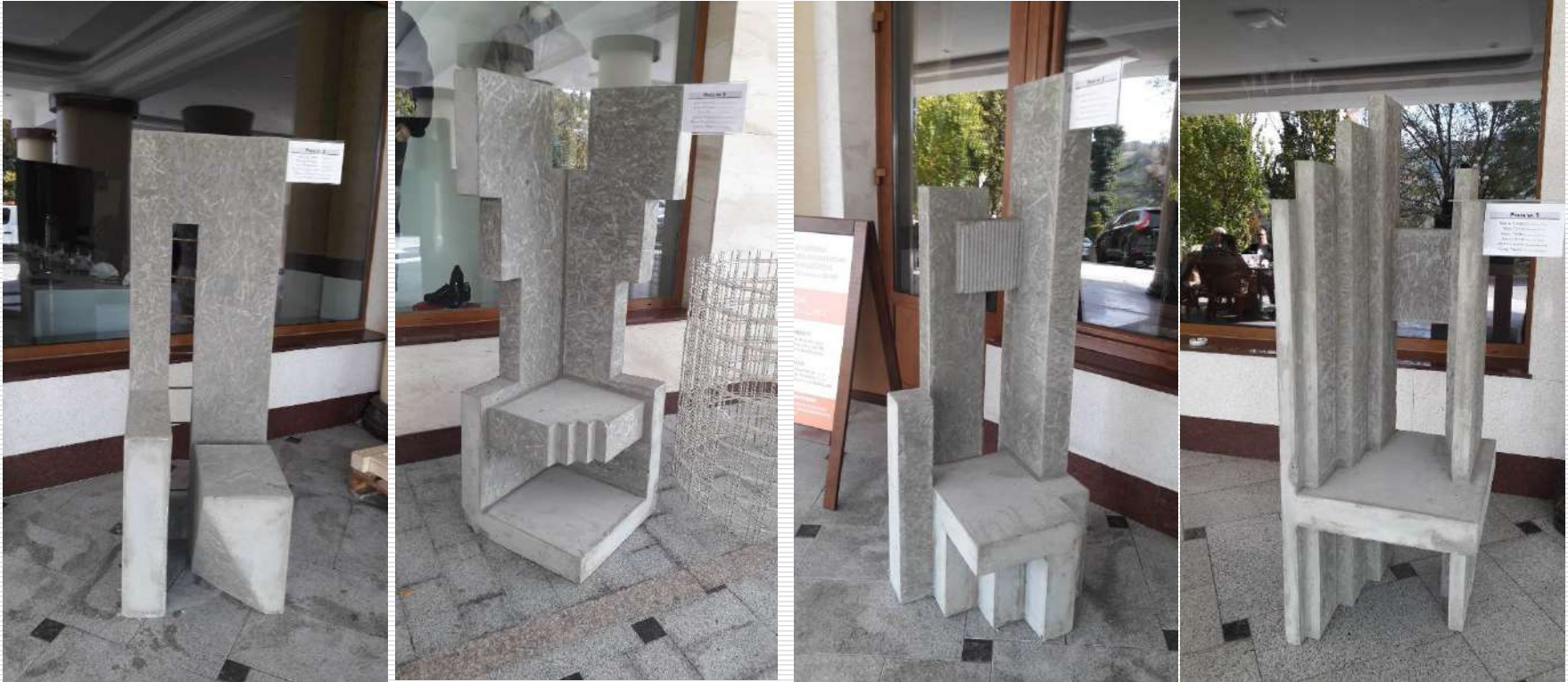
THRONE OF THE SNOW QUEEN