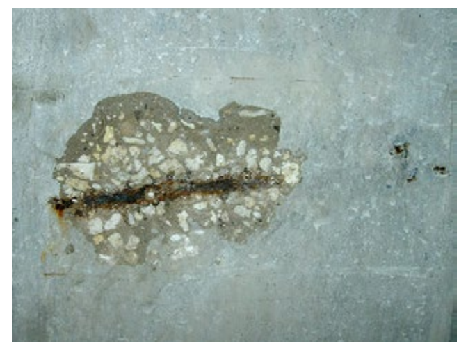
Fig. 1—Spalled concrete.

Hand application of concrete repair materials are used to reinstate spalled or delaminated concrete. Larger and deeper repairs may be more conductive to the use