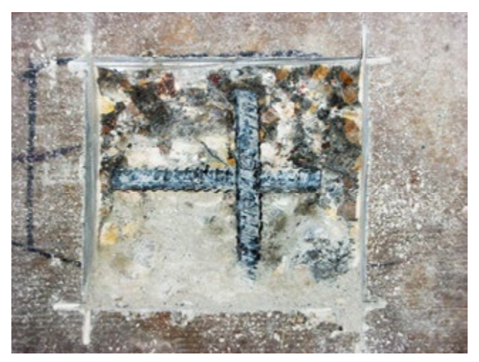
Fig. 5—Properly prepared surface.