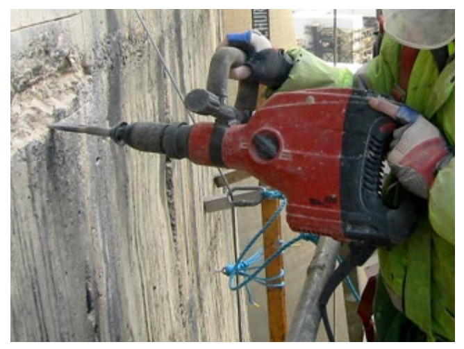
Fig. 2—Concrete removal.

of form-and-pump, form-and-pour, or spray application methods. Refer to the material manufacturer's recommendations for recommended repair material placement thickness. Placement thickness will vary depending on the type of materials selected and the size, depth, and orientation of the repair cavity and may range from 1/8 to 4 in. (3 to 100 mm) on vertical surfaces, and on overhead surfaces in a single layer. Deeper placements may require the repair material to be placed in additional layers. It is critical in applications where repair material is applied in multiple lifts that necessary care is taken to ensure bond between subsequent lifts. Failure to do so will result in interlayer adhesion problems and cause the repair to fail.