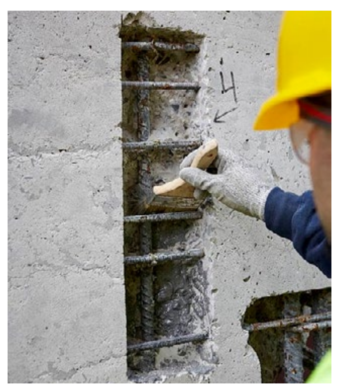
Fig. 6—Treatment of exposed reinforcement.