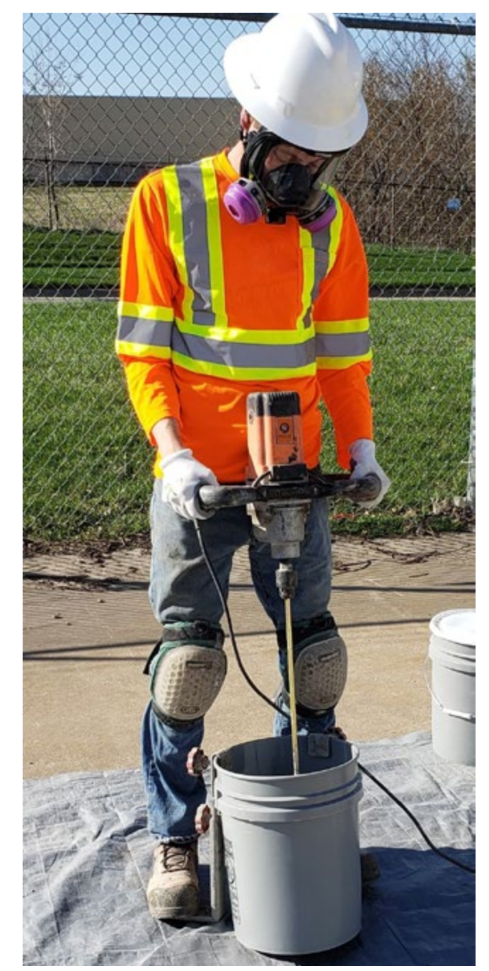
Fig. 7— Typical equipment to mix materials.

Typical equipment needed for hand-applied repair mortars includes: