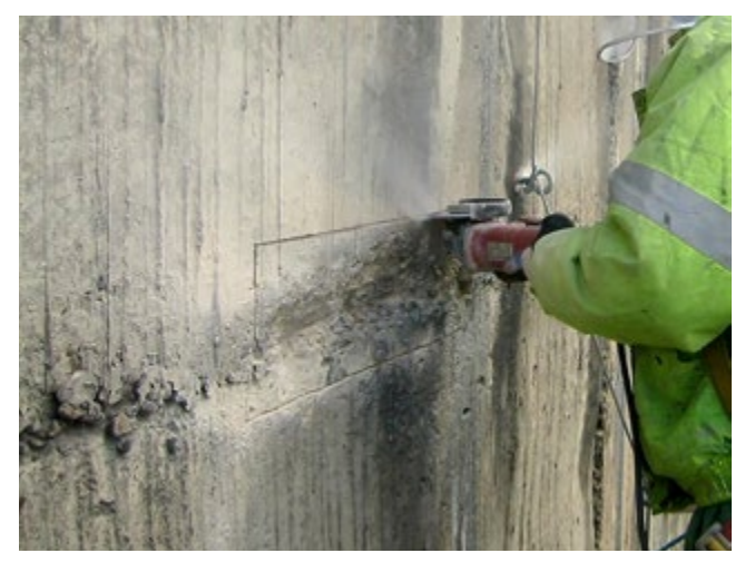
Fig. 3—Edge conditioning.

undercutting the corroded reinforcing steel by approximately 3/4 in. (19 mm). The shape of the prepared cavity should be kept as simple as possible, generally square or rectangular in shape. Repair configurations with reentrant corners should be avoided to prevent stress concentration that could cause cracking of the repair material cracking. The edges of the patches should be sawcut perpendicular to the surface to a depth of 1/2 in. (13 mm) to avoid feather edging the repair material (Fig. 3). Avoid cutting into reinforcing steel when sawcutting.