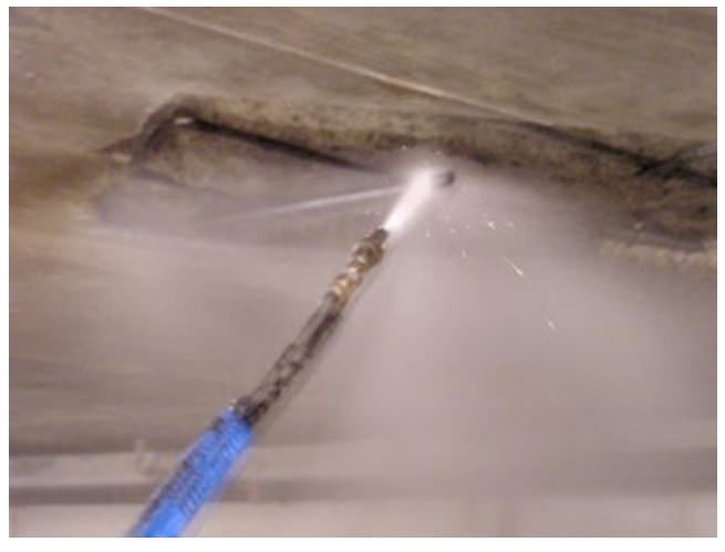
Fig. 4—Final surface cleaning after abrasive blasting.

4. Substrate saturation —Most portland cement-based materials require the base concrete to be in a saturated surface-dry (SSD) condition prior to application to prevent