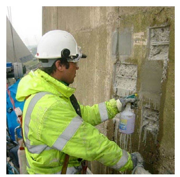
Fig. 9—Spray application of curing compound.

material. Once the desired thickness has been achieved, strike off level with the adjacent concrete.