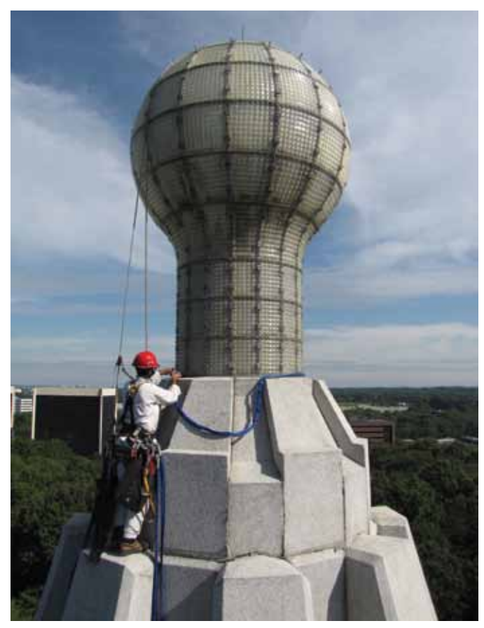
The concrete panels at the top of the Edison Tower are white with a cobalt blue color so they match the color of the sky. Closer inspection reveals the scale of the Pyrex replica of the light bulb. The light bulb will also be cleaned as part of the restoration process (Photo courtesy of Mills + Schnoering Architects, LLC)

The Earley Studio took the concept of precast thin-slab panels to another level of economy. At the Edison Monument, Earley used 2 in. (50 mm) thick mosaic panels as stay-in-place exterior forms for the reinforced concrete structure. The 10 to 17 ft (3 to 5 m) tall panels were produced in the Earley Studio in Rosslyn, VA, and