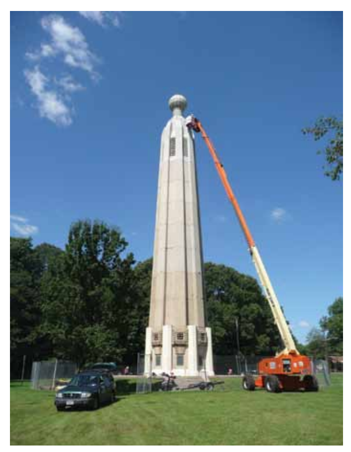
With its concrete heavily deteriorating, the state of New Jersey hired Mills + Schnoering Architects, LLC, to restore the Edison Tower. Field investigations in 2009 revealed that some panels, mostly the ones at the top, had to be completely replaced