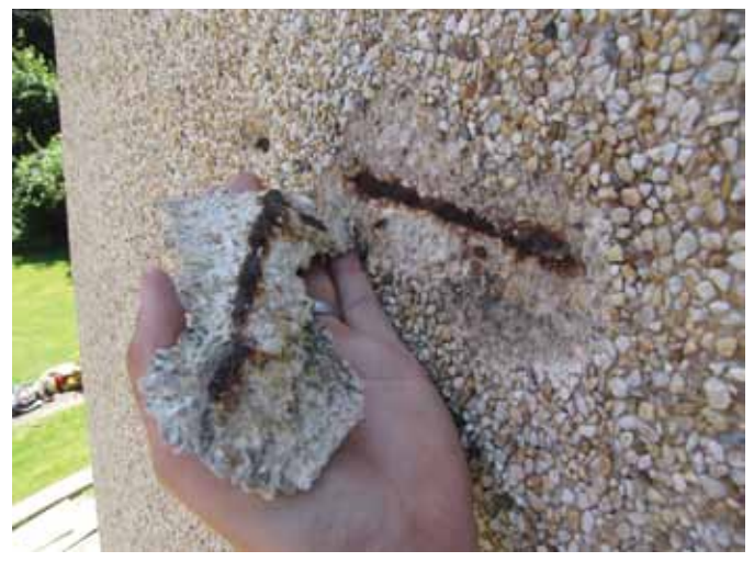
A corroded reinforcing bar behind the exposed aggregate concrete facing of the Edison Memorial Tower