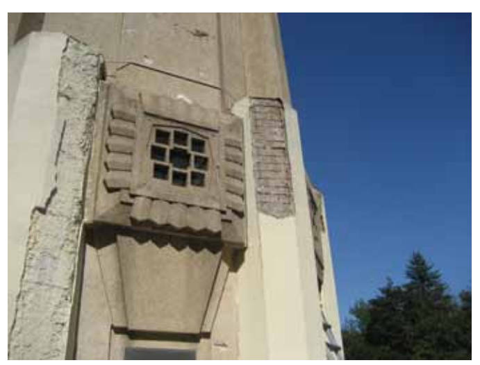
Field investigations at the Edison Memorial Tower revealed a range of deterioration caused by two factors: corrosion of the embedded reinforcing steel and cycles of freezing and thawing

some panels reduced almost to rubble. These two projects illustrate the range of issues involved in the restoration of this material.