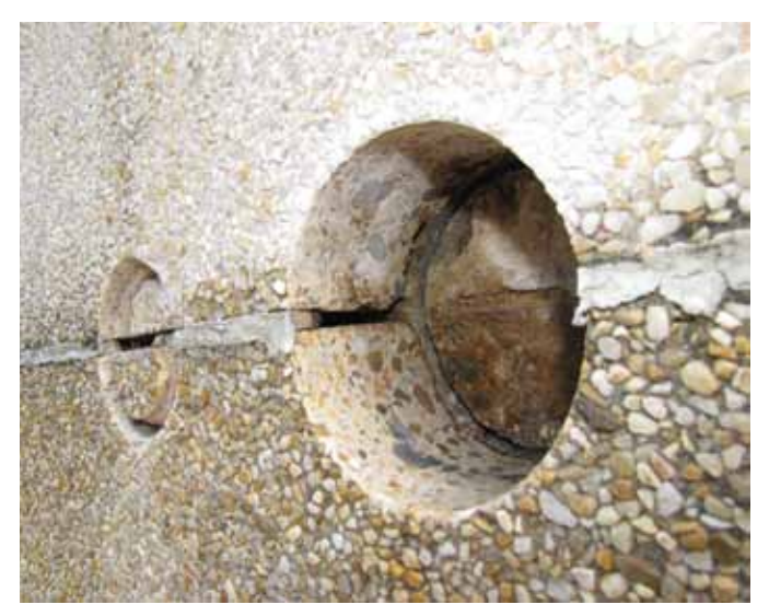
Concrete cores were taken from the Edison Monument to allow for laboratory analysis of the panel concrete. Panels were composed of a face mixture and a backup mixture. The panels served as the exterior forms for reinforced concrete that provides structural support of the monument

with a total thickness of approximately 2-1/4 in. (57 mm). Both mixtures were non-air-entrained, as would be expected of concrete of this vintage. Only limited evidence of alkali-silica reaction (ASR) was detected, but no deleterious expansion was observed. Samples removed from the buttresses at the base consisted of a concrete that contained red and black glass in the coarse and fine aggregates. No evidence was found that this layer of material had suffered from ASR or damage from freezing and thawing; however, the backup mixture behind this layer suffered from severe damage from freezing and thawing.