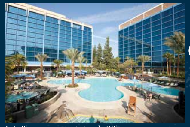
As to Disney properties/artwork: ©Disney.