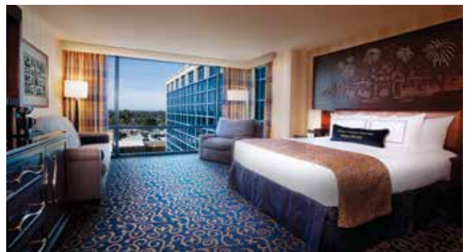
As to Disney properties/artwork: ©Disney.

Hotel contracts require ACI to be financially liable for unused sleeping rooms. The sleeping room rate covers the cost of meeting space and the labor to set up each meeting room. Staying at the convention hotel also provides you with the benefit of after-hours networking and easy accessibility to meetings and sessions. Please help ACI avoid unnecessary penalties and keep registration fees low by booking your sleeping room at the Disneyland® Hotel.