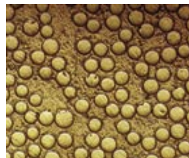
Microscopy photo of Hughes Brothers Rebar - 240 X