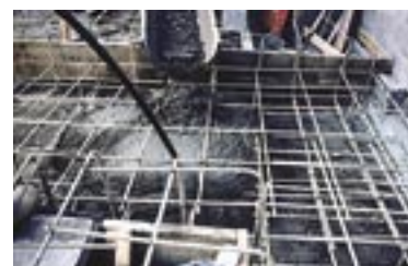
Some bent shapes are made using appropriate lap splicing.