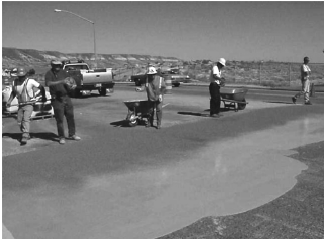
Fig. 4—Aggregate should be broadcast over the surface before the resin becomes tacky but at least 20 minutes after applying the final coat.