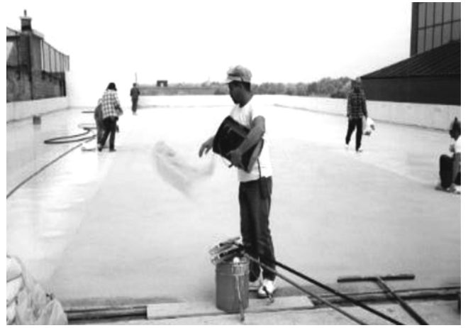
Fig. 3—Aggregate broadcast onto the surface before the resin cures can increase traction.