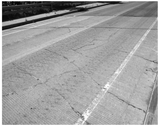
Fig. 1—Methacrylate flood coats are well-suited to concrete slabs that have a large number of random cracks but no evidence of steel corrosion or AAR.

This repair is well suited to bridge decks, parking garages, industrial floors, or other concrete slabs that have a large number of random cracks but no evidence of steel corrosion or AAR, such as the roadway shown in Fig. 1. The effect of the methacrylate on skid resistance should, however, be considered for bridge decks exposed to heavy traffic and high speeds. The methacrylate flood coat will seal the slab and fill open cracks, with the intent of keeping water, salts, and chemicals out of the concrete. Methacrylates are not