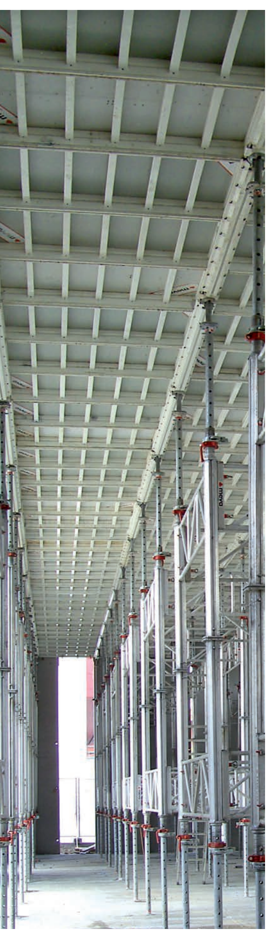
Fig. 1.1: Manufactured metal formwork system for concrete floor slab construction

produced commercially and used in the field. Continuing refinement of basic ideas such as these represents another area of ongoing progress within the formwork industry. Today, formwork and forming systems have become an integral part of the entire equipment array on site and of the overall construction planning process. The comparison of metal versus wood and job-built versus manufactured systems (Fig. 1.1 and 1.2) continues today with many varieties in use and the decision ultimately based on factors of quality, safety, and economy for the individual project.