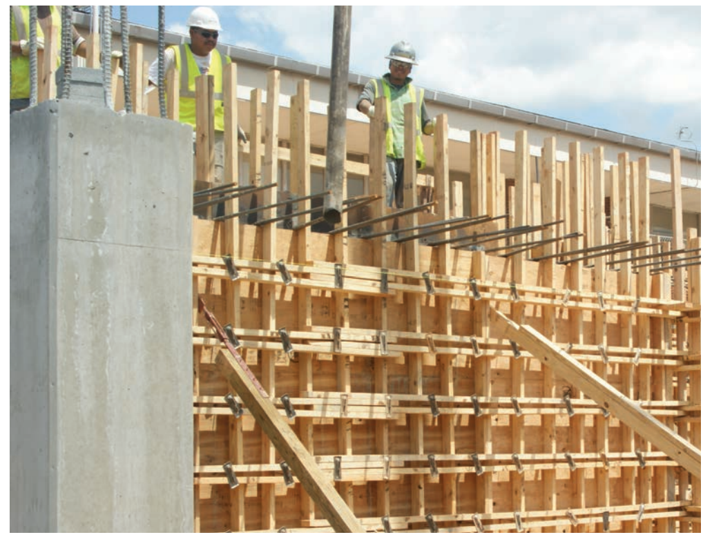
Fig. 1.2: Job-built wall formwork constructed of wood materials

Form building requires both job-site innovation and engineering understanding. There is certainly no substitute for the skill and sense of "know-how" that come with job-site experience. In a similar manner, many engineering principles can be used to improve the safety, quality, and economy of formwork.