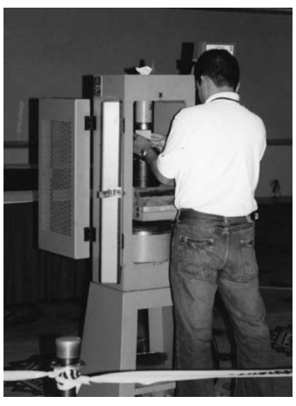
Testing device provided by SCI Engineering

Students must produce a concrete cylinder made of specific cementitious materials that will withstand a compression test and other performance measuring criteria. Come cheer on your favorite team!