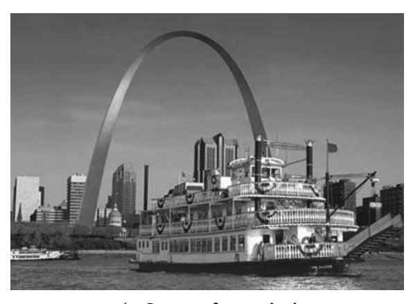
√ = Separate fee required

Next experience the "Mighty" Mississippi first-hand during a Gateway Riverboat cruise. You will board a replica paddle wheeler for a one-hour sightseeing cruise where you can take in the views of the dramatic St. Louis skyline. A boxed lunch is included with your cruise ticket.