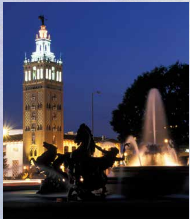
JC Nichols Fountain