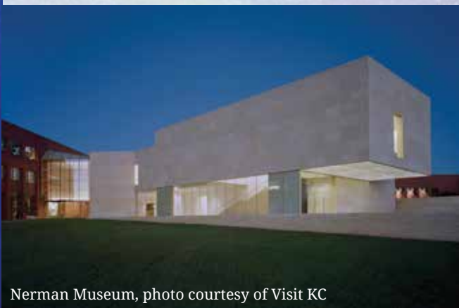
Nerman Museum