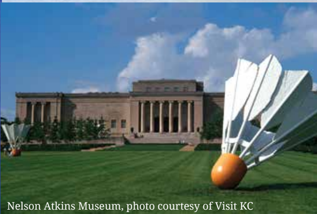
Nelson Atkins Museum

ACI would like to thank the following organizations for their donations. Sponsors listed as of 12/10/14.