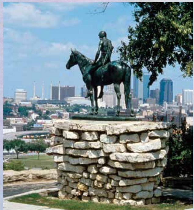
The Scout

Don’t miss out on important convention announcements and updates! Follow the Convention on Facebook, Instagram, and Twitter with #aciconvention for the latest information.