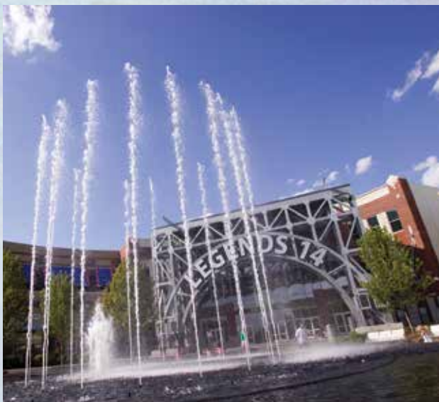
Legends Fountain, photo courtesy of Visit KC

ACI has recently published the newest edition of ACI 318, "Building Code Requirements for Structural Concrete (ACI 318-14)." This edition represents the first major change in Code organization in over 40 years and has been completely reorganized from a designer's perspective. This seminar will help you get acquainted with the new organization and various technical changes to the code as quickly as possible and demonstrate how you can ensure that your design fully complies with the new code.