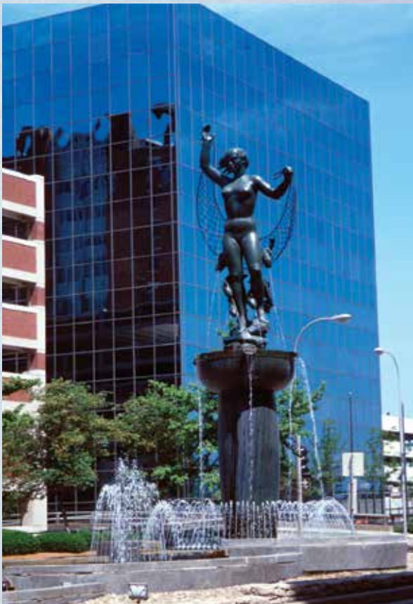
Muse of the Missouri Fountain

The average daily high in April for Kansas City, MO, is 65°F (18°C) and the average low is 45°F (7°C). Visit www.weather.com for the latest weather forecast.