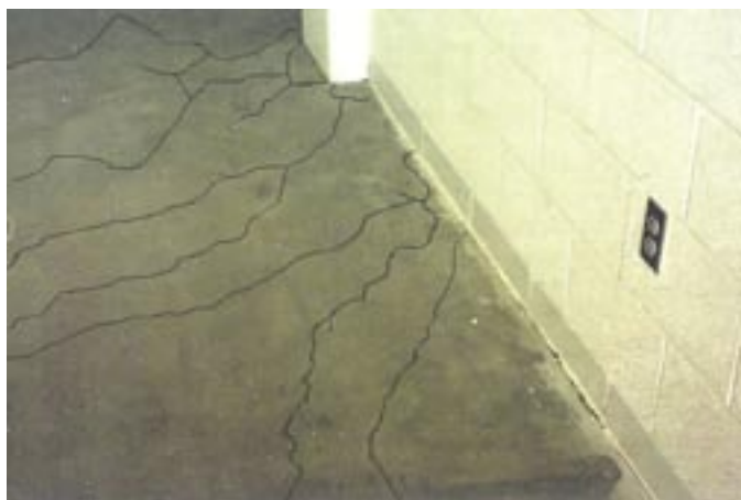
Fig. 1: Typical radial concrete cracking around columns due to premature removal of shores and reshores