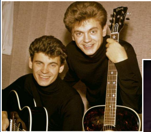
The Everly Brothers