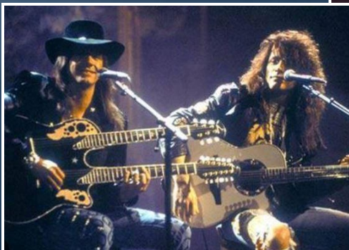
Jon Bon Jovi & Richie Sambora