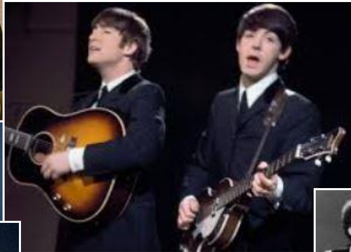
Lennon & McCartney