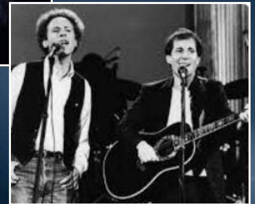
Simon & Garfunkel