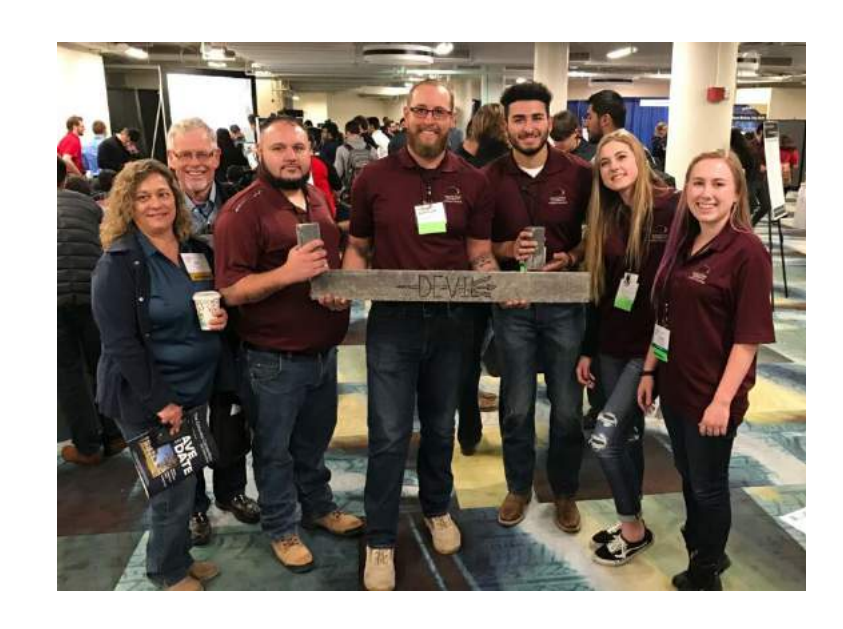
FRP Composites Competition Detroit, Spring 2017