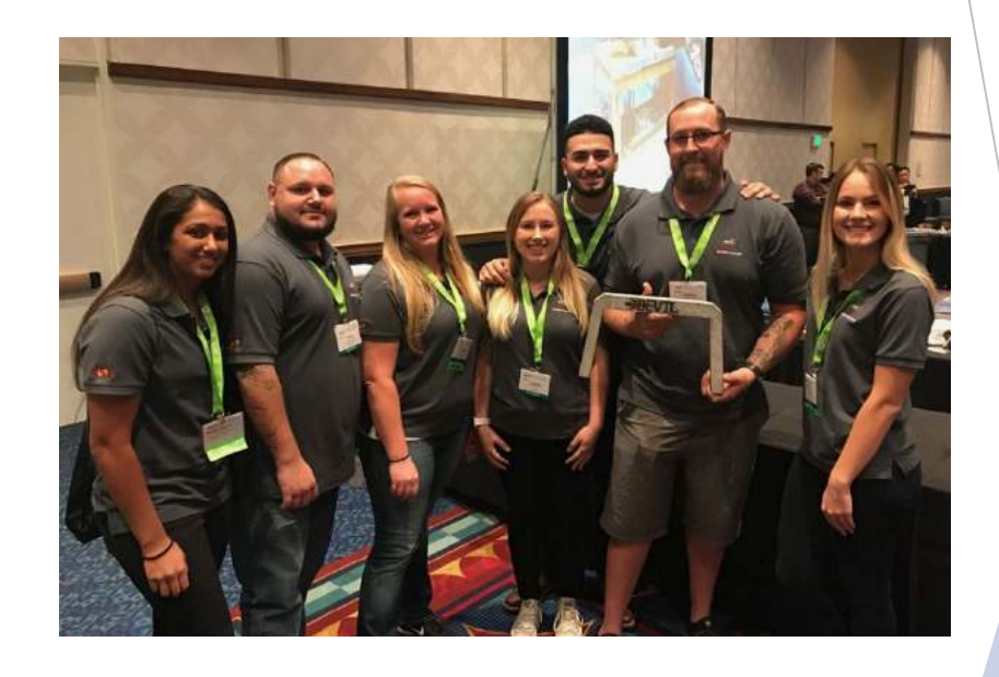
Egg Protection Device Competition Anaheim, Fall 2017