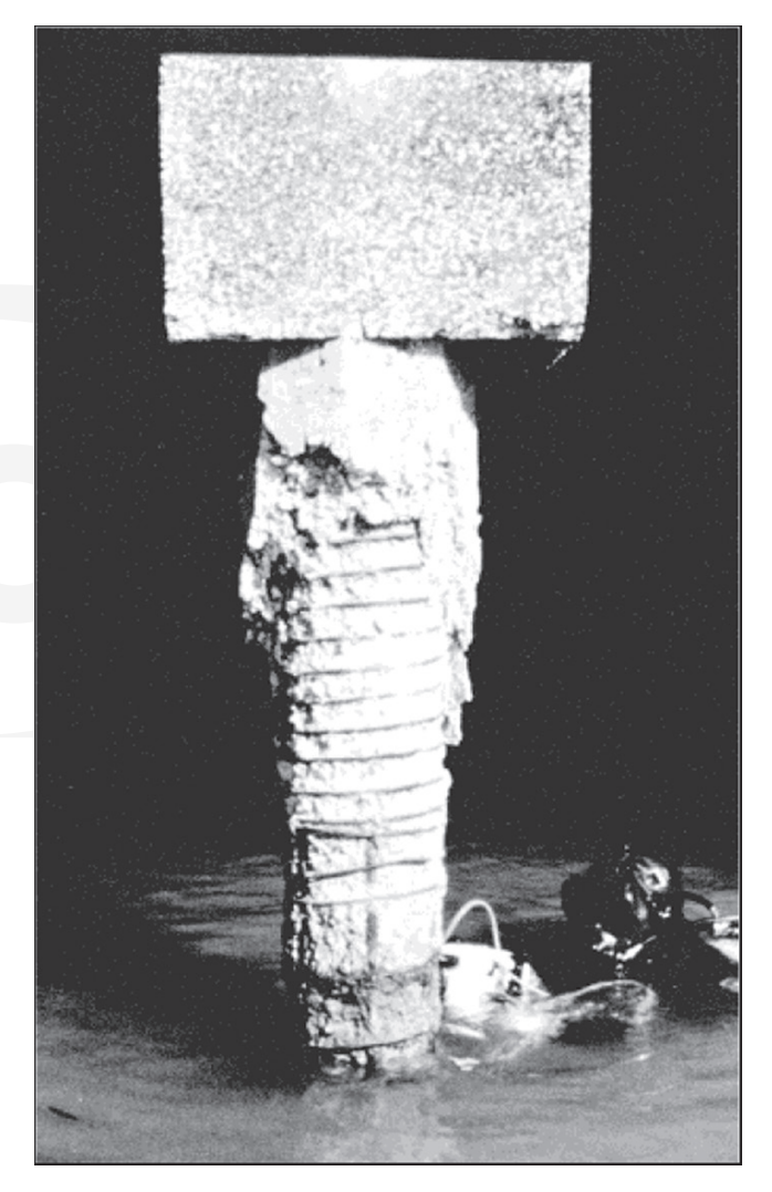
Fig. 1.1b —Deteriorated pile in tidal and exposed zones.

differences. The repair of concrete under water is usually difficult, requiring specialized products and systems, and the services of highly qualified and experienced design professionals and contractors.