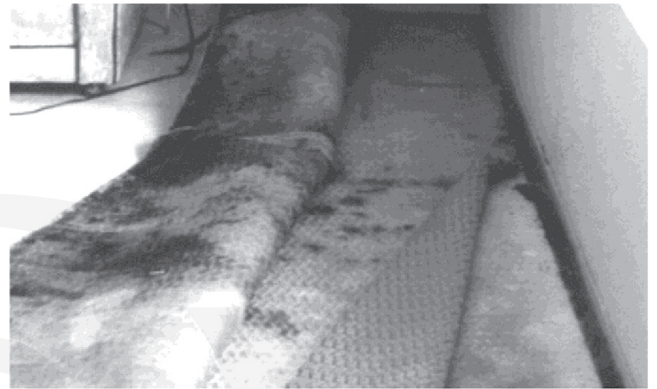
Fig. 1.3d—Mold growth in carpet due to moisture in concrete.