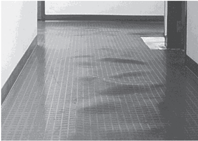
Fig. 1.3a—Debonded sheet flooring due to moisture in the concrete slab (photo courtesy of P. Craig and H. Protze III).