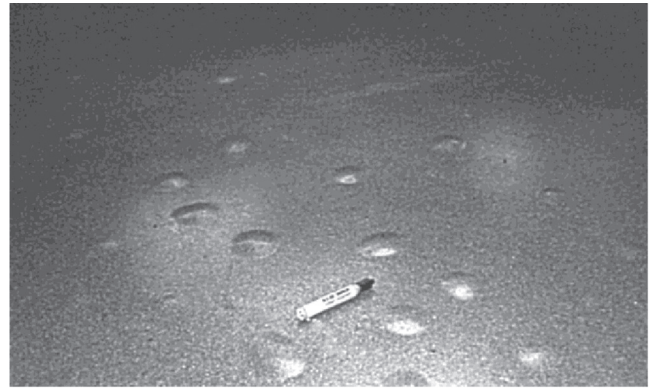
Fig. 1.3c—Blisters due to moisture in concrete.

This document focuses on the behavior of moisture in concrete slabs and the effect of the concrete moisture condition on the performance of applied flooring materials. Reaching a desired moisture state, however, should not be