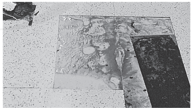
Fig. 1.3e—Adhesive degradation leading to debonded solid vinyl tile installed over asbestos tile.

the only acceptance criterion for a concrete slab that will be coated or covered. Floor flatness, surface texture and finish, cracking, curling, structural capacity, jointing requirements, and the potential for the slab to stay acceptably dry should also be considered. The goal is installation of a flooring system—subgrade, subbase, vapor retarder, concrete slab (and possibly reinforcement), coating or flooring adhesive, and floor covering—that satisfies performance requirements.