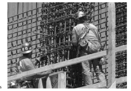
Detailing columns with mechanical couplers can help reduce congestion and improve constructability

"Concrete constructability" has sometimes been used as a marketing buzzword. It is a catchy phrase, but we believe that