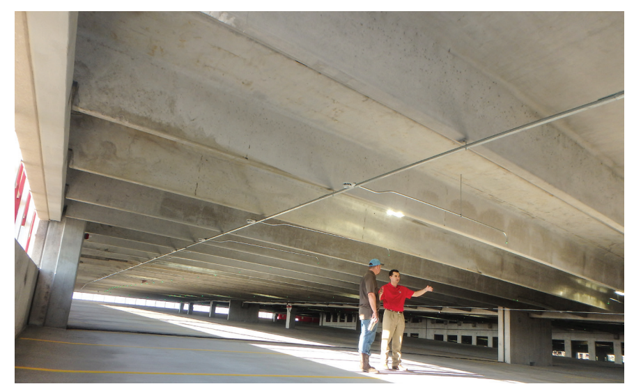
Fig. 8—New replacement double-tee beams at completion

The public garage proved to be a limited-space jobsite, leaving little room for repair materials and contractor use/laydown. While complexities were abundant, the project team worked efficiently to have the garage fully operational by the start of the fall semester. Ultimately, the team was able to come in under budget and ahead of schedule on repairs.