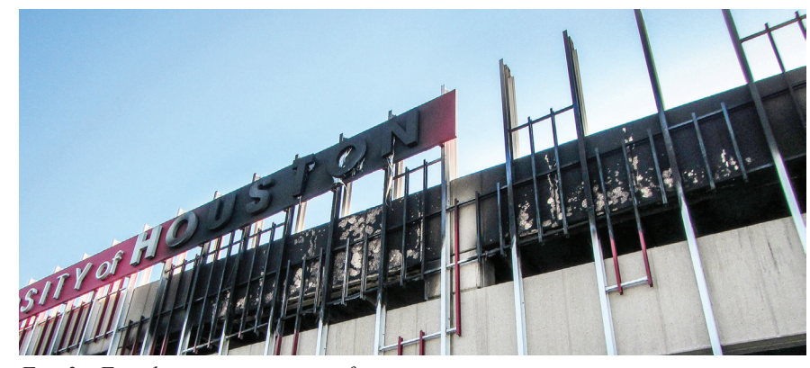
Fig. 3—Fire damage at exterior of garage