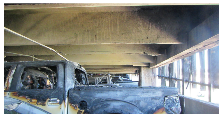
Fig. 2—Fire damage on Level 3 of parking garage