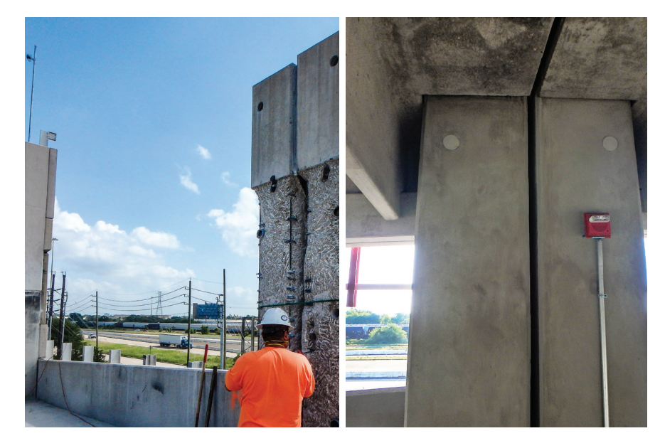
Fig. 9—Column during repair (left) and after repair (right)