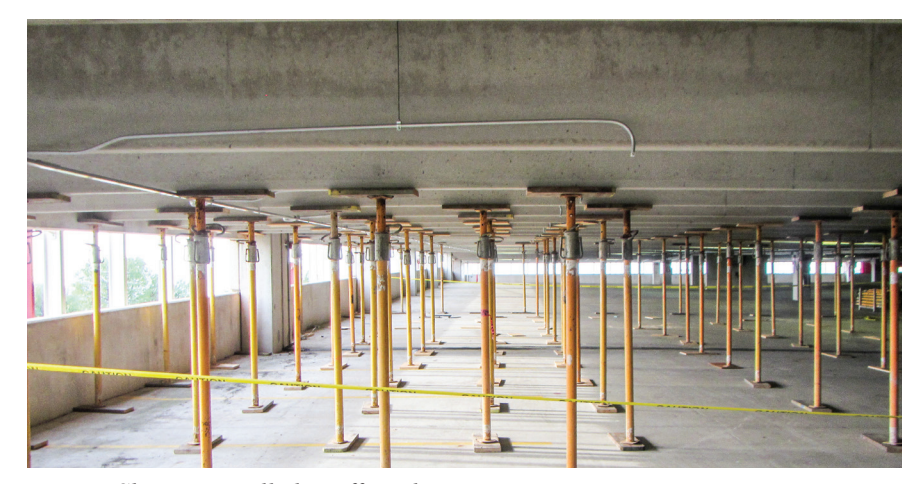
Fig. 4—Shoring installed in affected areas