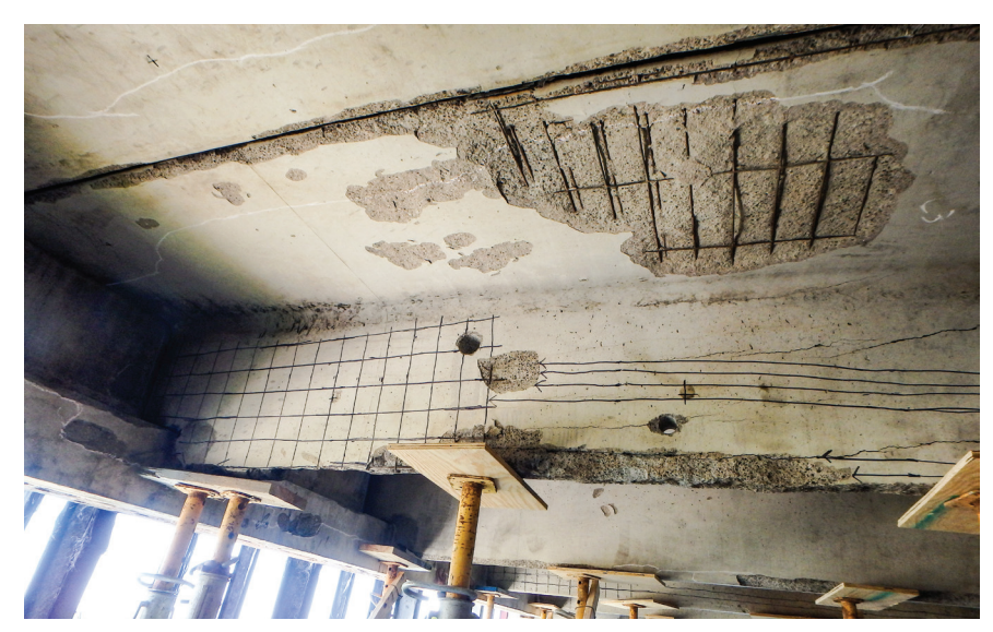
Fig. 6—Concrete cracking and spalling due to fire