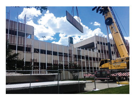
Fig. 7—Spandrel beam replacement

In addition to visual observations, a limited floor delamination survey was performed utilizing a chain dragging device to detect unsound concrete. An acoustical monitoring wheel and hammer sounding was used to detect delaminated concrete on the vertical and overhead elements.