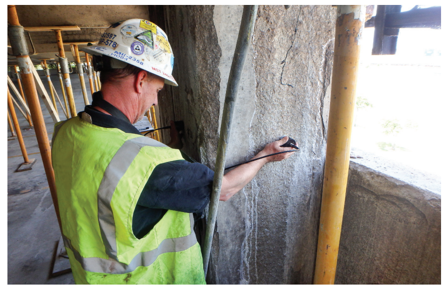
Fig. 5—Nondestructive testing performed at damaged column