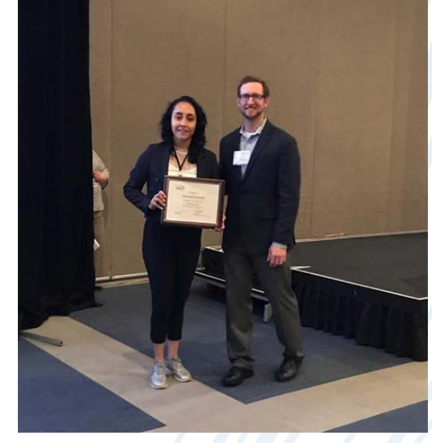
2nd Place in ECO CONCRETE CYLINDER COMPETITION