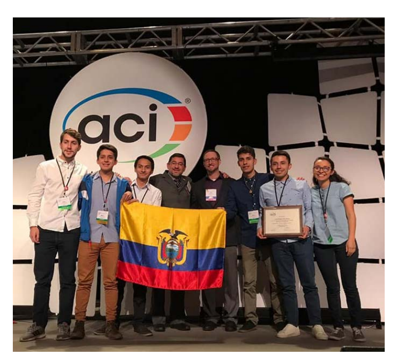
3rd Place in PERVIOUS CONCRETE CYLINDER COMPETITION