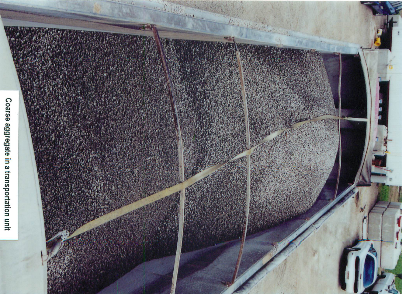
Coarse aggregate in a transportation unit