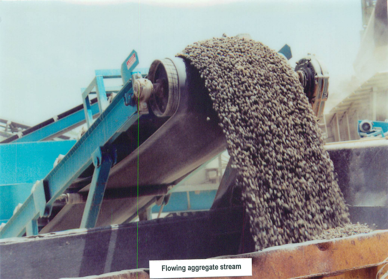
Flowing aggregate stream