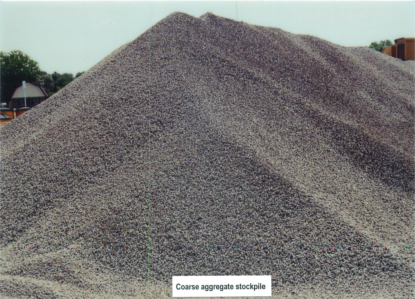
Coarse aggregate stockpile