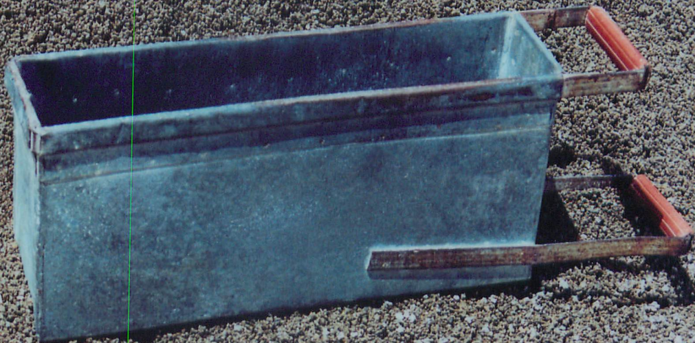
Flowing aggregate stream sampling device