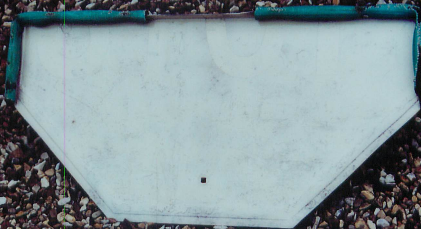
Board for stockpile sampling