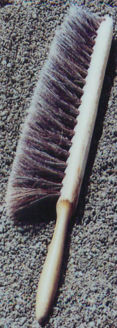
Dust pan and brush