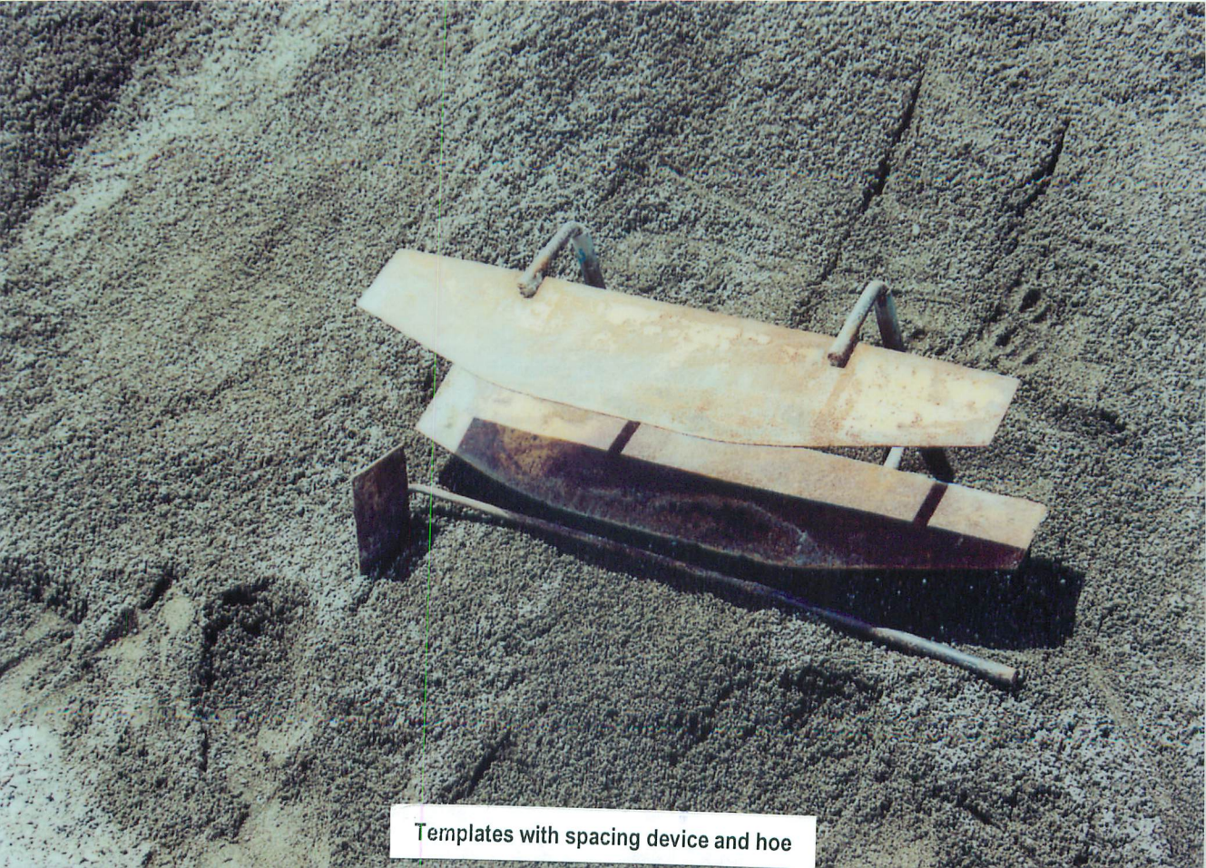
Templates with spacing device and hoe