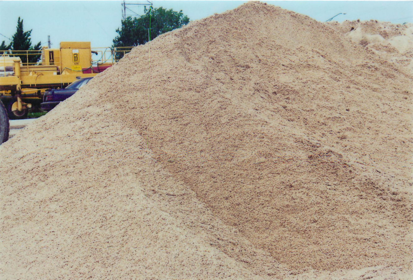
Fine aggregate stockpile