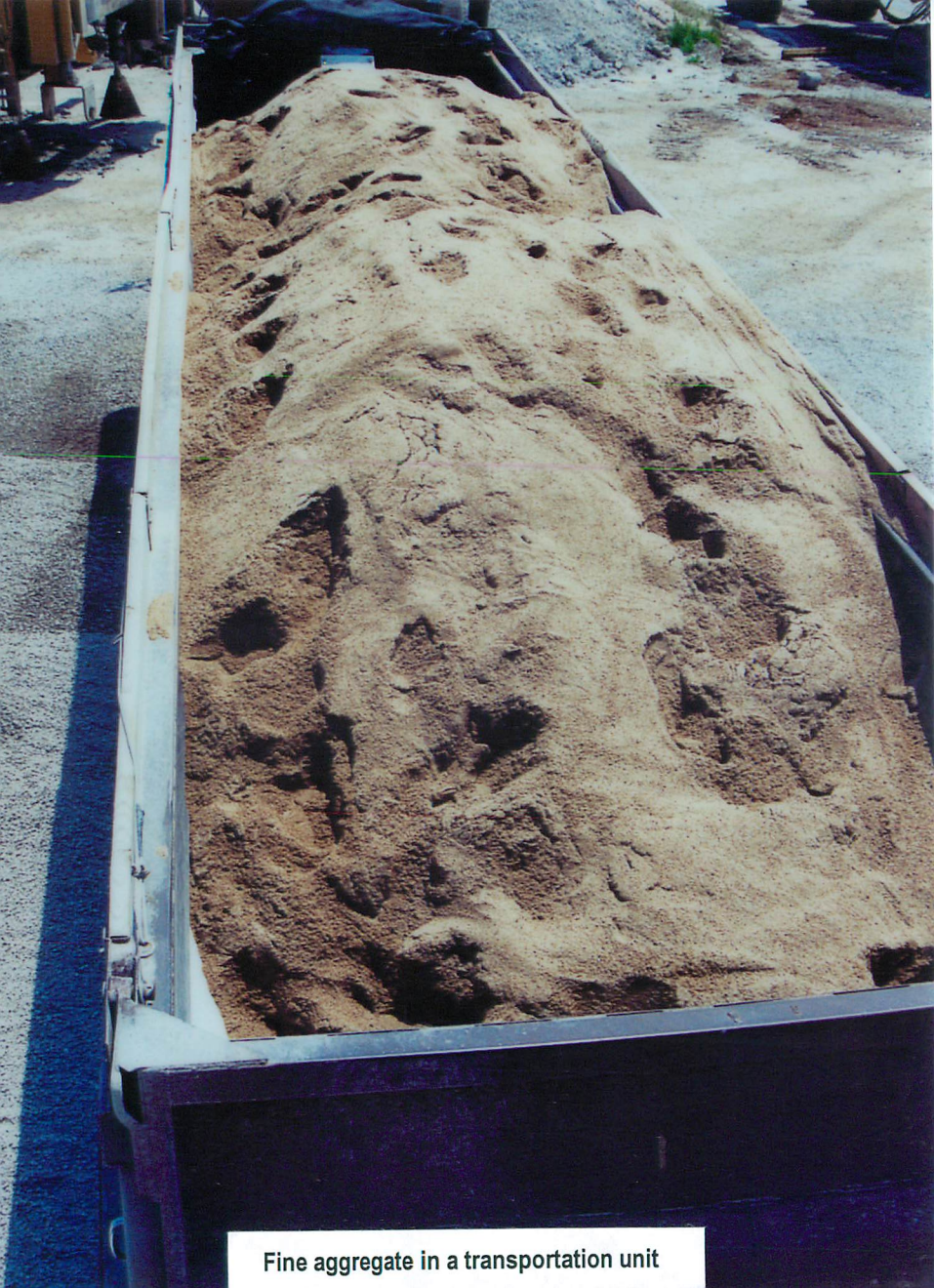
Fine aggregate in a transportation unit