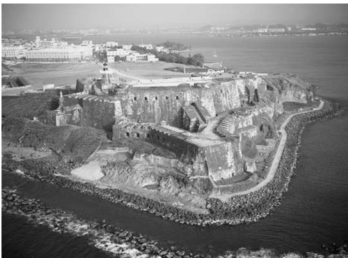
El Morro Fortress

It is highly recommended that you wear comfortable clothing, walking shoes, sunscreen, and a hat. Please note: Old San Juan is approximately 60 minutes one-way from the El Conquistador.